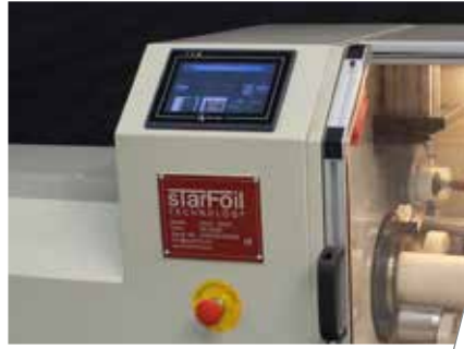
Operator's touch screen PL SACC2000

Professional semi-automatic core cutting machine, which is designed to be a cost effective unit requiring the minimum of operator intervention.