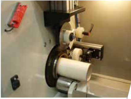
Cutting section PL SACC2000