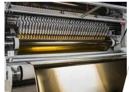
Shear slit unit