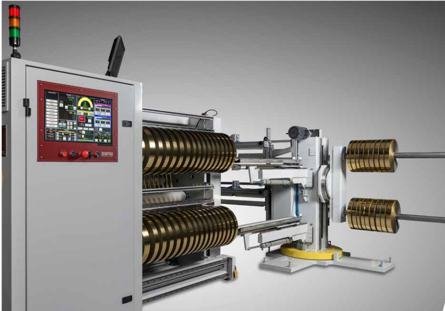
Automatic core loading / Automatic offloading robot

This machine will accommodate jumbo rolls with a diameter of max 1.000 mm and max. 2.100 mm wide on 3" / 6" internal diameter cores by means of shear slitting. It will unwind under controlled tension, slit to narrower width and can rewind on to 3" and 6" (optional) internal diameter cores to a maximum of 610 mm. It produces good quality rolls in terms of rewind tension and roll edge profile at speeds up to 600 metres per minute.