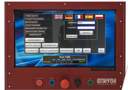
Touch screen control panel