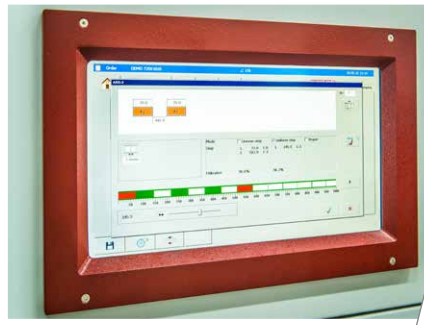
Touch screen control