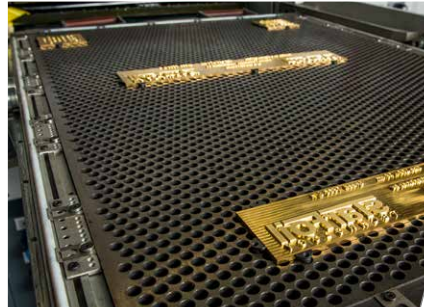
Honeycomb plate with toggle hook clamping system