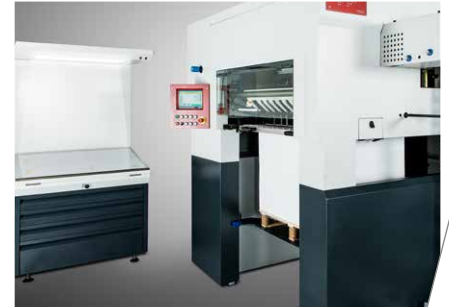
Delivery with inspection table