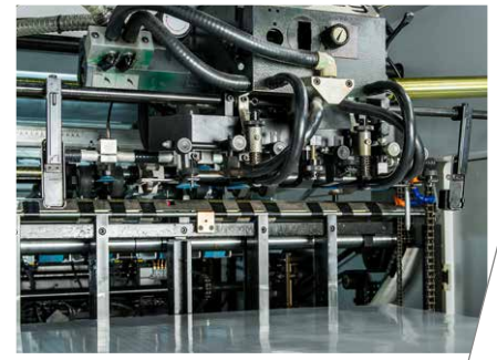
Mabeg feeder head