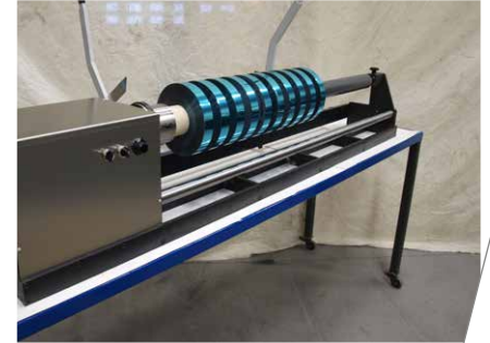
CCC840 / CCC1400