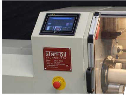
Operator's touch screen PL SACC2000

Professional semi-automatic core cutting machine, which is designed to be a cost effective unit requiring the minimum of operator intervention.