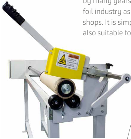
Cutting section VL CC800

This high quality core cutting machine is proven by many years of experience in the hot stamping foil industry as a must for all foil consuming print shops. It is simple and reliable, easy-to-use and also suitable for foil cutting.