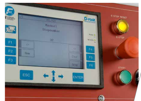
High comfort display